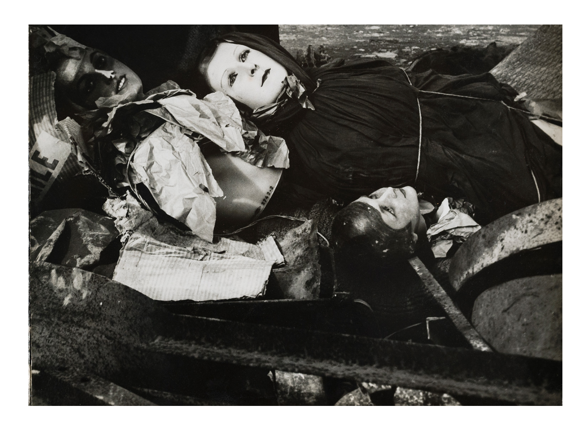
Lucien Clergue, The Rag-picker's Mannequins, Arles, 1956.