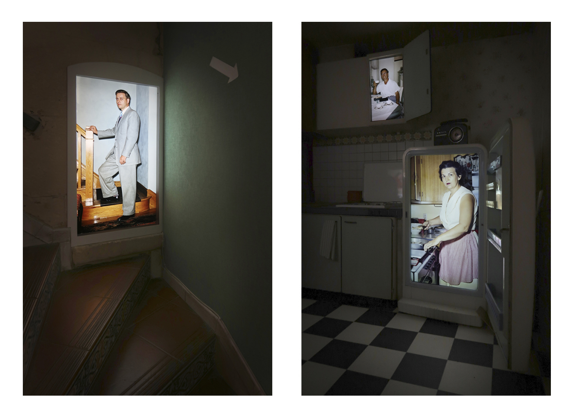
The Anonymous Project: The House exhibition view