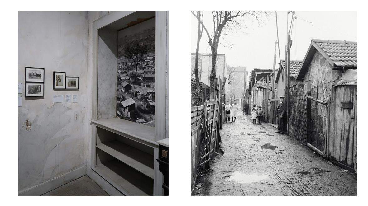
Left: The Zone: At the Gates of Paris exhibition view Right: L. Chifflot, The Zone, Gentilly , France, ca. 1939.

More information: www.rencontres-arles.com