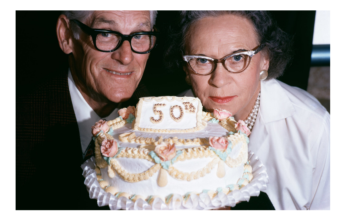
Anonymous, 1972.