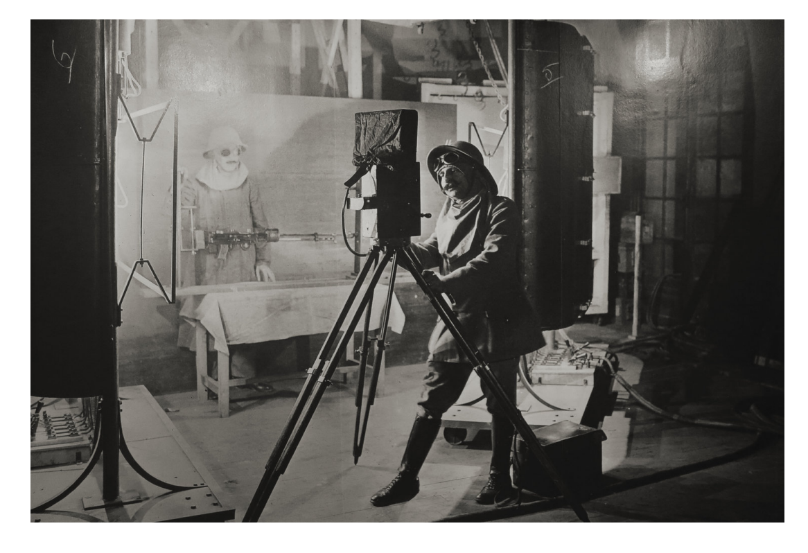
The Saga of Inventions exhibition view

This week is dedicated to summaries of what happened during the Rencontres d'Arles opening week [1-7 July 2019]. Below is a selection of shows that particularly caught our attention.